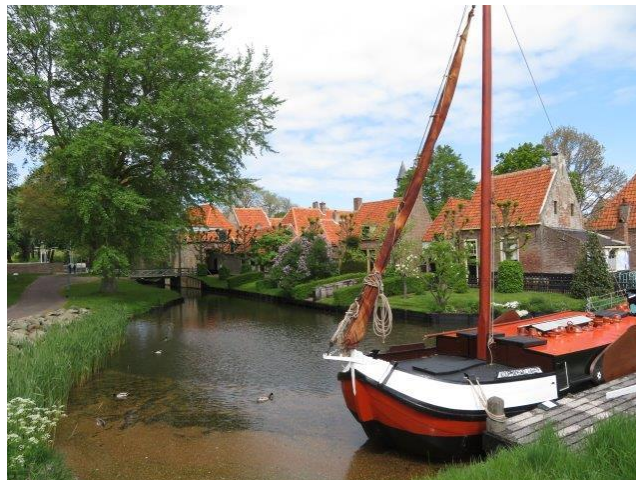
Working Boat at the Zuiderzee Museum