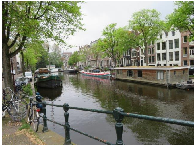
Houseboats on a Side Canal