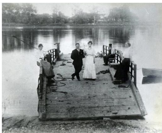
Windsor's Bissell's Ferry