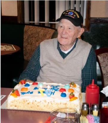
What's better than cake?