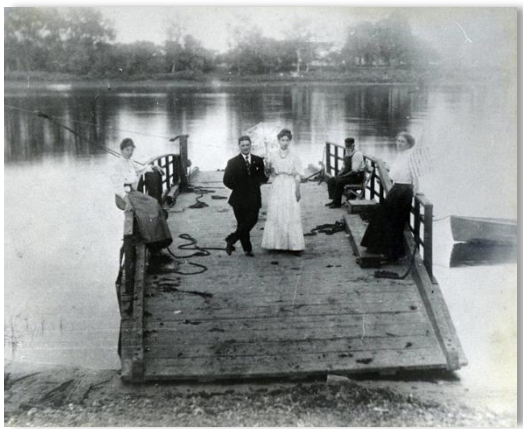
Windsor's Bissell's Ferry