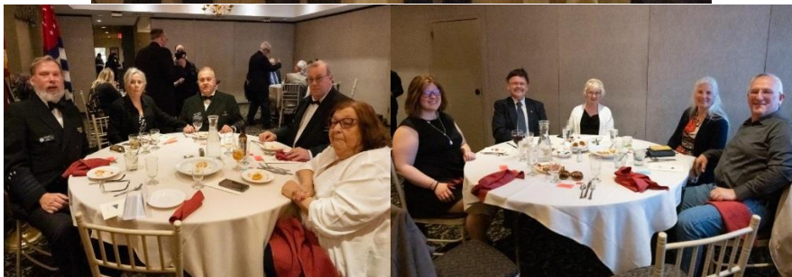
L & R Enjoying COW Dinner at the Manor Inn, Plantsville, CT