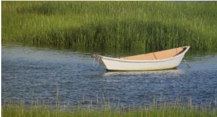
Nantucket Pond