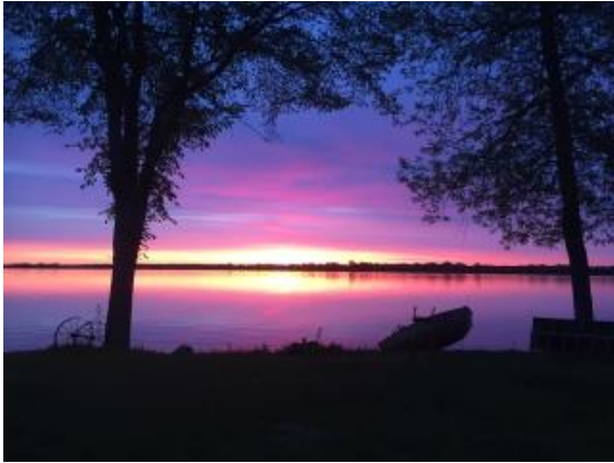
Serenity

As promised, the winning photograph has been featured on the issue's cover. Below are the five runners up.