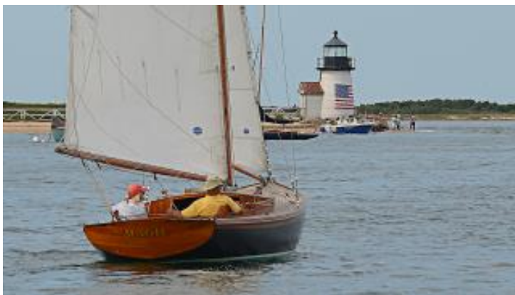
Nantucket Magic