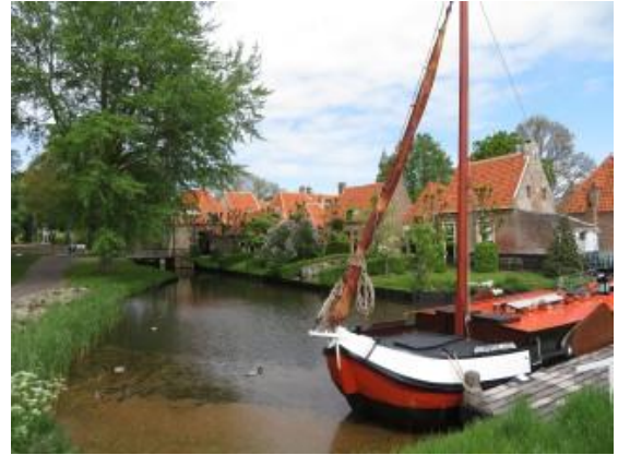
Zuiderzee Fishing Boat