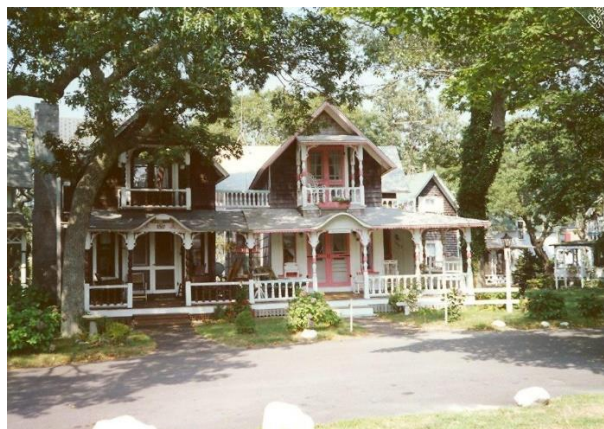
Gingerbread houses at Oak Bluffs Camp Meeting Ground