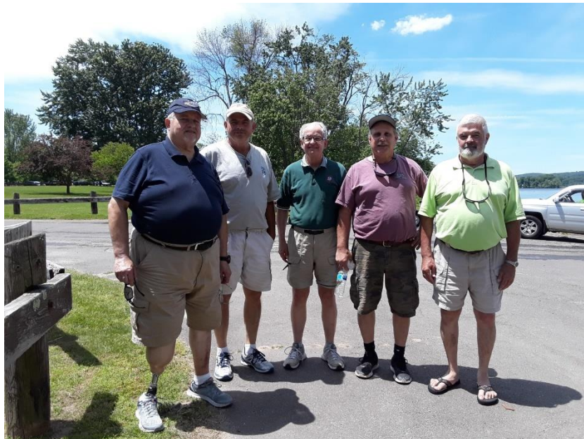
Participants included L. to R.:

All the reported items (19) with problems were reported to the USCG. All the reported items (68) require a USCG Report 7054 to be filled out and then attached to a report to the USPS CoOp Charting Committee. The reporting took approximately 11.5 hours. Hopefully we will get a lot of credit from National as we found several problems.