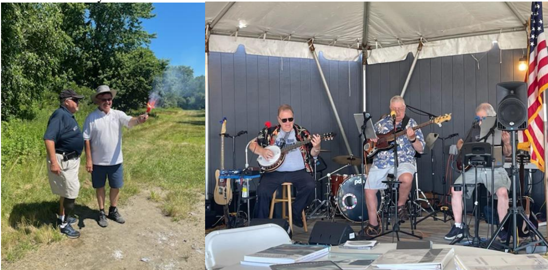
Flare demo photo courtesy of the Essex Fire Dept. Entertainment photo by Cdr William J. Waseleski, AP