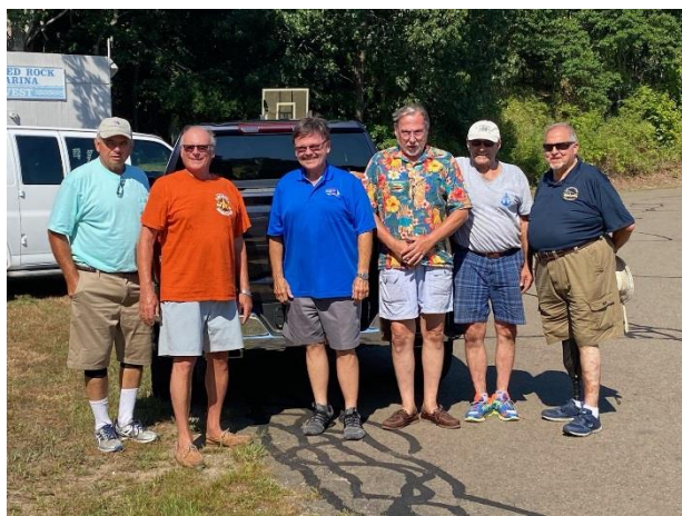
Members of the Hartford Power Squadron ExCom at Ragged Rock Marina for August Meeting